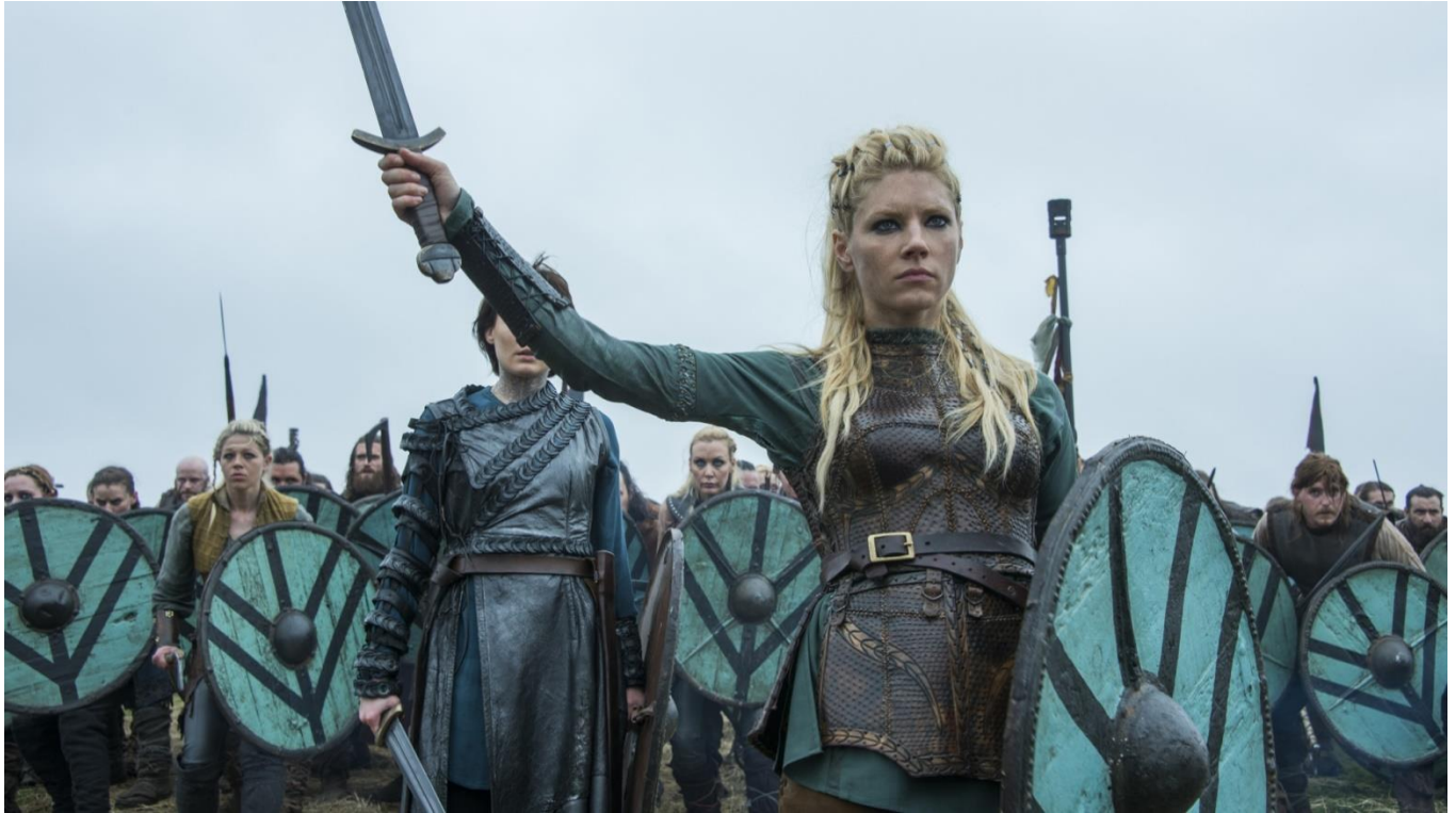
Still from the History channels series "Vikings"

Vikings and other medieval cultures seem to be quite popular in our times. There are TV-series, feature films, comics and reenactment arrangements, and then there are the many films and series about myths, cults and legends like Game of Thrones, Lord of the Rings etc.