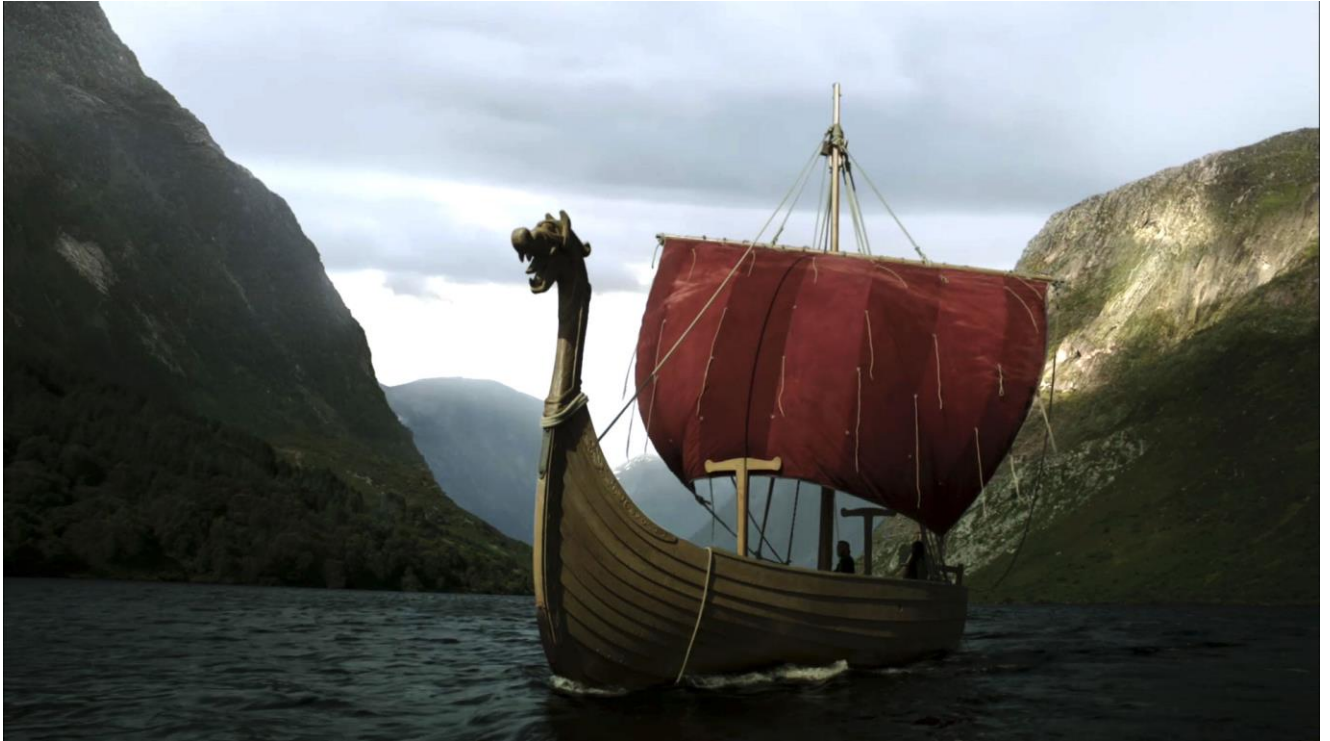
Still from the History channels series "Vikings"